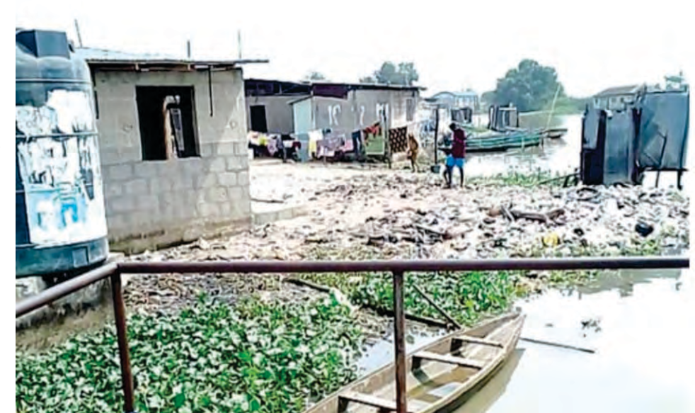
Agboyi community condition

Bothered about this sad scenario and its effects on the wellbeing of the society, a concerned individual, who saw the business opportunity presented by the development, sunk a borehole in the community and started selling water to the residents.