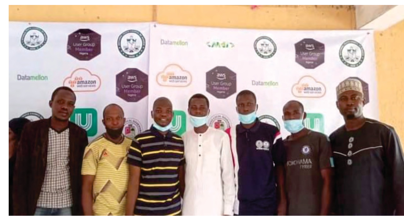
A group picture of Ambassadors of Amazon Web Services in Alimosho LGA

He urged the National Youth Council of Nigeria and other Youth groups in the area to sensitize youths on the importance of learning cloud computing.