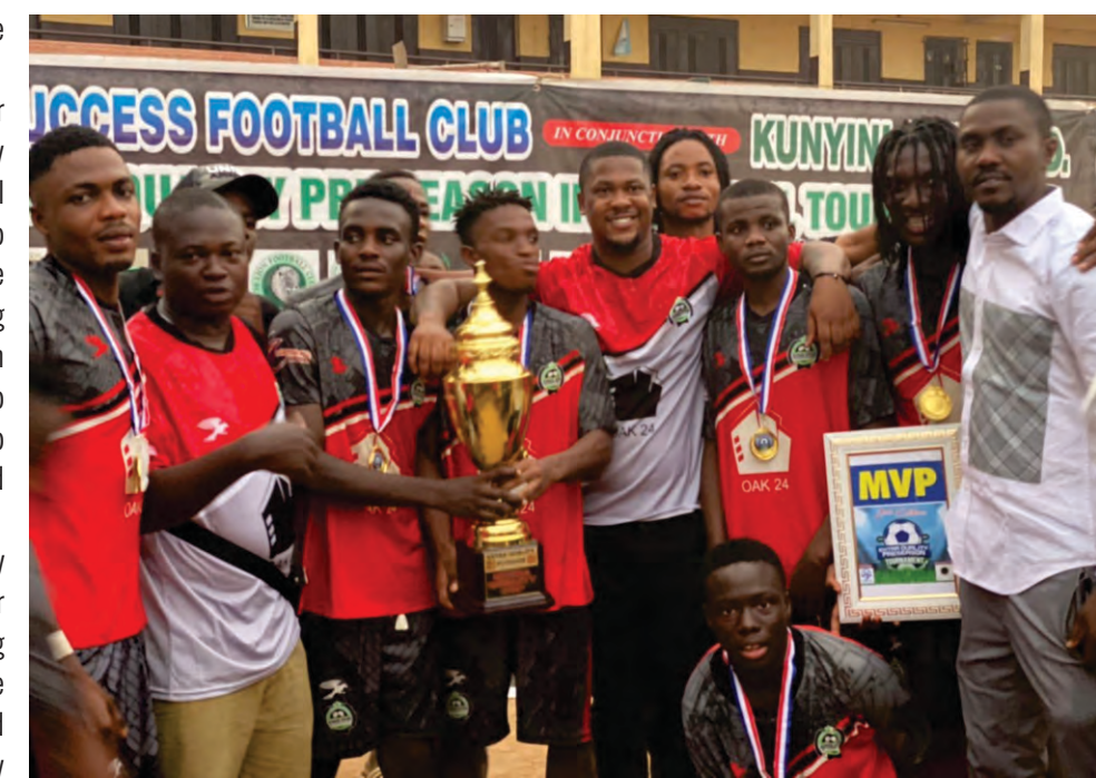
King Spor FC champions of Extra Quality Preseason Tournament

Satech FC could not find a way past the defense of King Spor the team emerge the champions of the second edition of the Extra Quality Preseason Tournament.