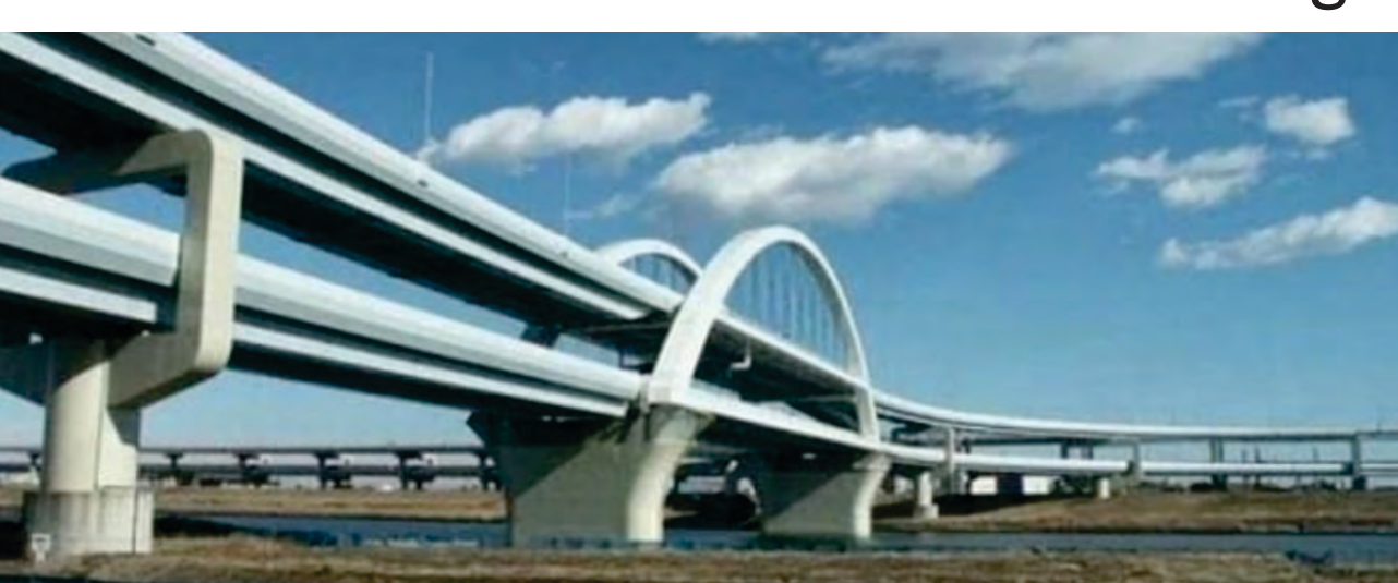
The fourth Mainland bridge under construction